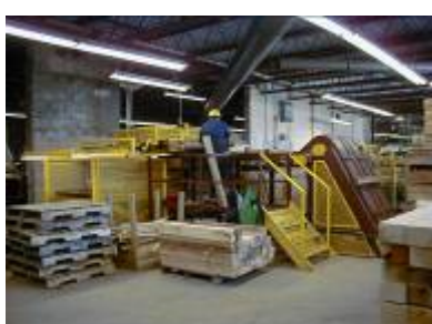
The GBN REDI STAK is the best pallet material stacker on the market.