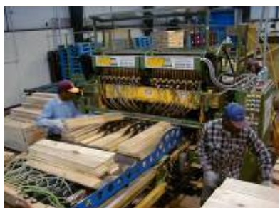
Excalibur: The King of the Hill, the fastest nailing system on the planet.