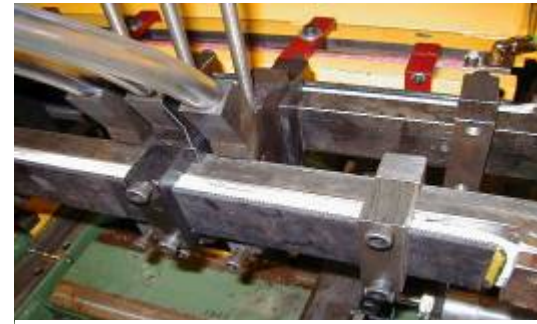
Air Clamping, no wrenches means faster changes. Compensating Chucks.