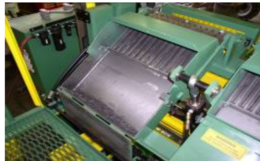
2 Nail Pans hold 100 lbs. of loose nails and have quick unloading.