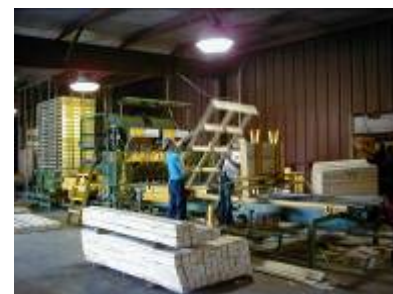
Patriot: Versatile and Productive, a great performer with fast changeover.