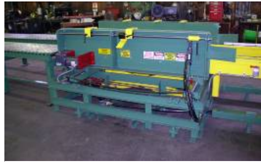
All hydraulic Stacker. GBN uses this on all its systems.