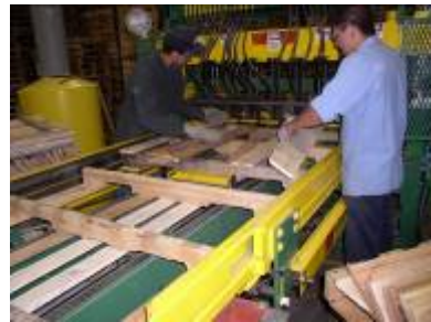
Trailblazer: A basic and productive two nailer system. (Running Recycled)