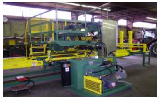
Simple, efficient Hydraulic Power. Oversized Nail Cat Walk is for safe loading.