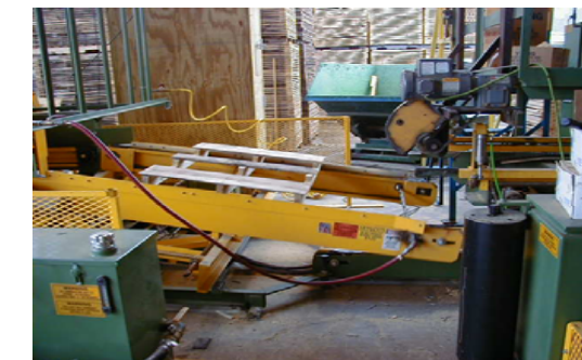
Half Pallet returned under nailer, not through it.