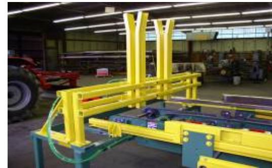
Hopper for Stringers, the GBN Mini Feeder.