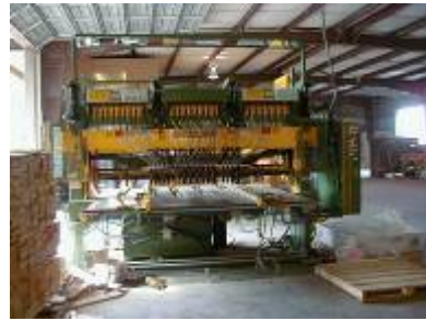
Assembly Series: Fast Changeover with 60, 72 and 100 Inch Models.