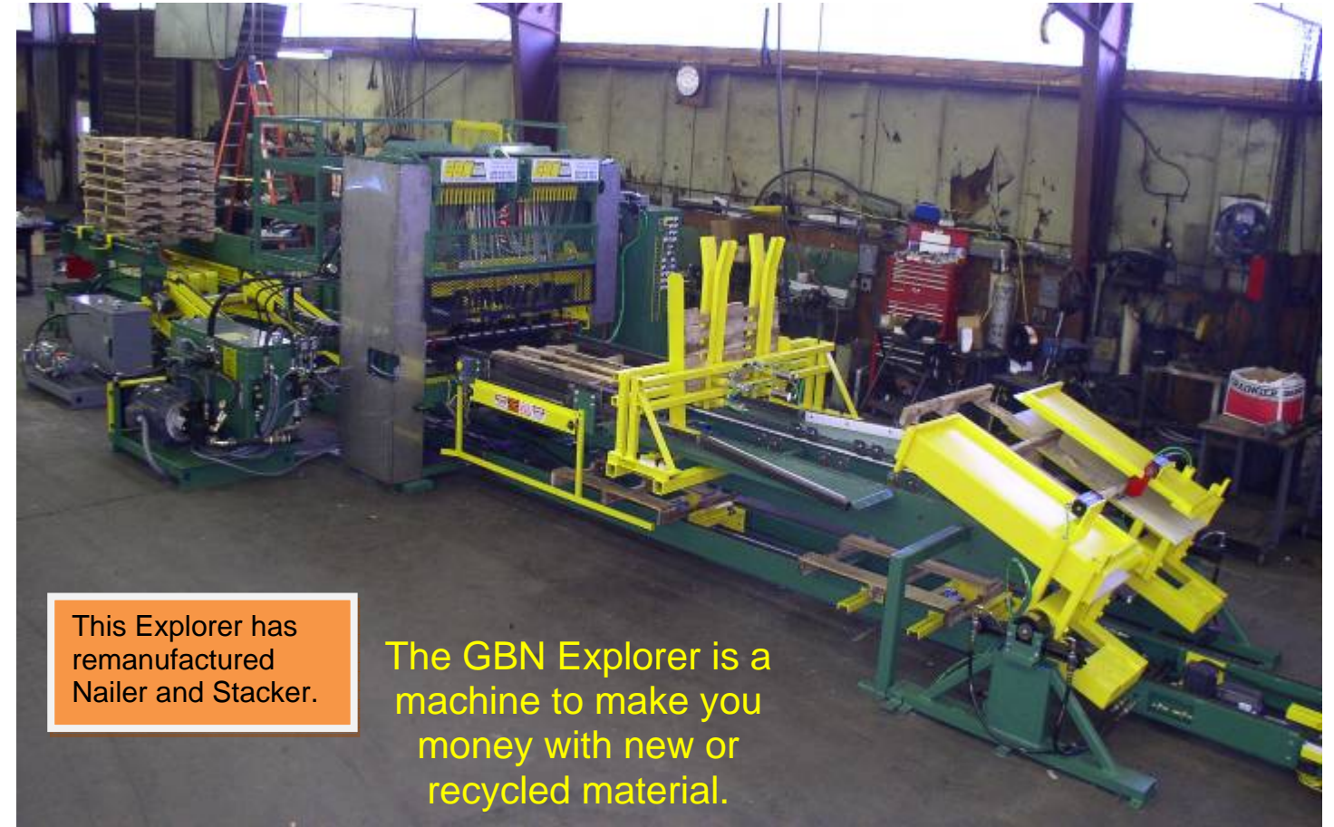
This Explorer has remanufactured Nailer and Stacker.