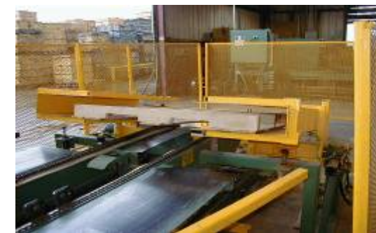
Automatic Turner. No Manual labor involved.